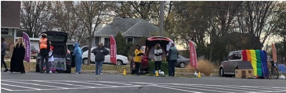
Images Top/Right/Bottom: Getting ready to welcome our Super Heroes!