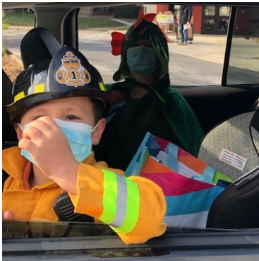
Images Left/ Right/Bottom: Lots of Super Heroes came to show their support!