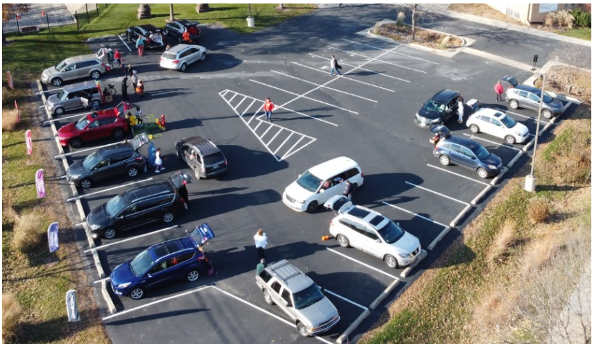
Image: Aerial view from the October costume cruise.