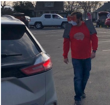
Images Top/Bottom: Brick Brain doing his best to intimidate our Super Heroes!