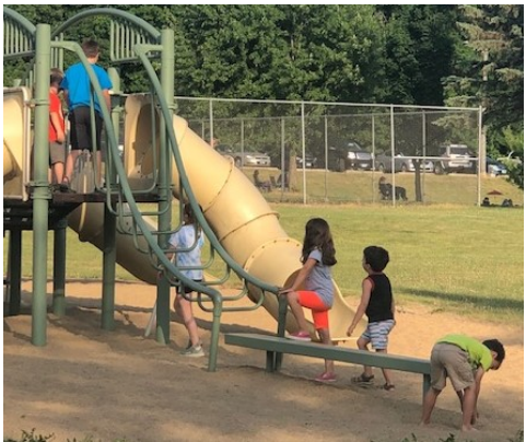
Image top / bottom: Enjoying getting to know one another again during our Wednesday picnics.