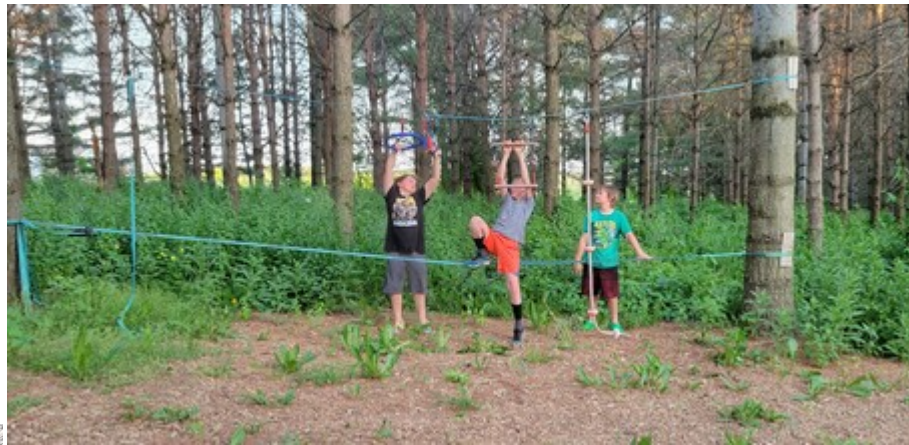
Image Top Left: Incoming 6th graders enjoyed some fun with an Escape Challenge.

Image Left / Top Right: Teens gathered at the home of the Wieland's for fun and smores!