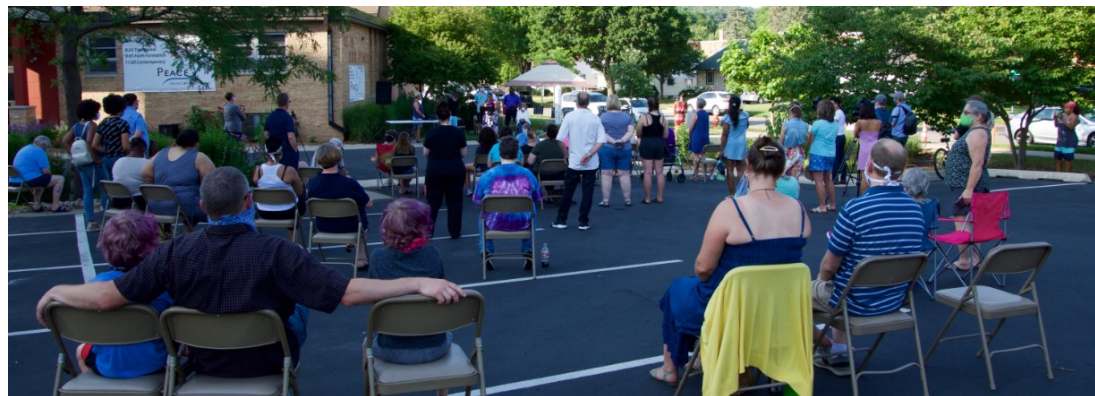
Scenes from BLM Vigil - July 8 Top Left: Peace Members discuss their thoughts Top Right: A moment of silence Bottom Left: Attendees showing their support