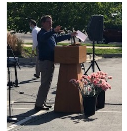
Image right: Closing the service by gathering in a circle and singing "Let There Be Peace on Earth"