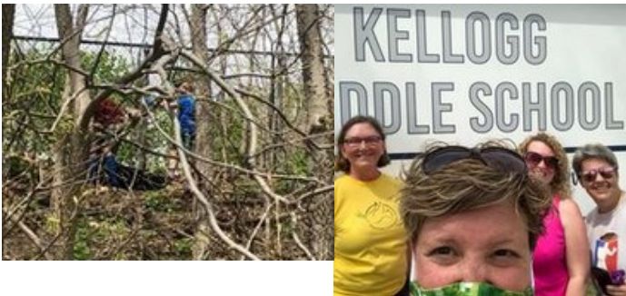
Participants for the Litter Bit Better Campaign & Roadside Cleanup—Thank you!!