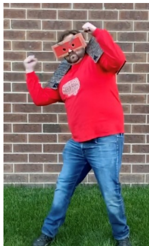
Images Above/Right: Brick Brain and our super heroes show their dance moves in our recent story saga