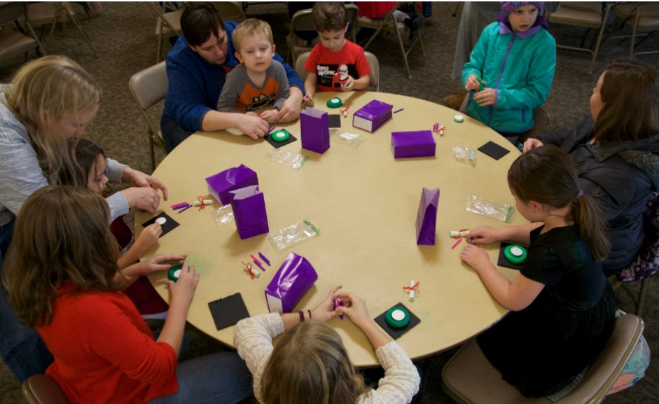
Image Left: Children await direction as they create their own Advent Candle Wreaths