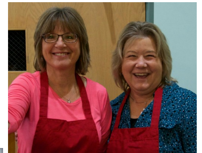
Image Left & Top: Helpers at the Annual Bazaar. This year's proceeds raised the most. Money was donated to Peace Youth, general fund and building fund.

SUNDAY, JANUARY 26: 9:45a—Our Annual meeting will be held between services (9:45a) to bring everyone up to date on the happenings of our church, Following the 11a service, we will once again hold our SPAM cook-off as well as a favorite hot-dish cook-off. This is a time for you to show off your favorite dish where we will all vote on the winner!