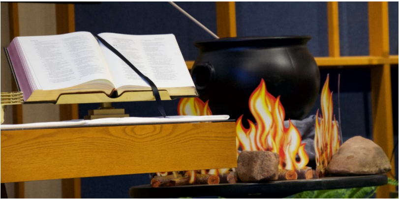
Image above: Stone Soup - Recipe for Growth: What will you contribute? 2020 Stewardship Campaign Theme.

At Peace, we believe that accompanying one another on life's journey is what community is all about. While each person's life takes its own unique and beautiful path, community is about caring for each other through the ups and downs so we never truly travel alone.