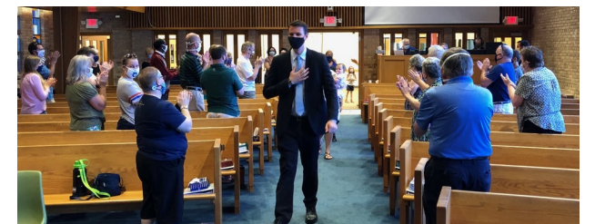
Top Photo: Winton is greeted with a standing ovation

In keeping with the times, we have a children and teen Compassion Bingo game that begins now through August 23 (outdoor worship). Children and teens are encouraged to fill it out. Bring your completed 'BINGO' card to our outdoor worship and get a Dairy Queen treat. All fully completed cards will be submitted for a $25 Visa card drawing. Let's show our compassion to everyone around us!