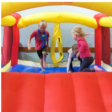
Image top left: Teens make the space their own with a new chalkboard wall. Image bottom left: Children play in a bounce house on Rally Day.