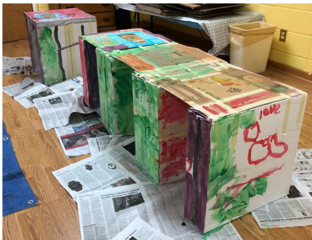
Top, Right, & Left: Tables made by our youth during worship rotation

Adult Faith Formation: Enlarging our Table: Homelessness in Rochester